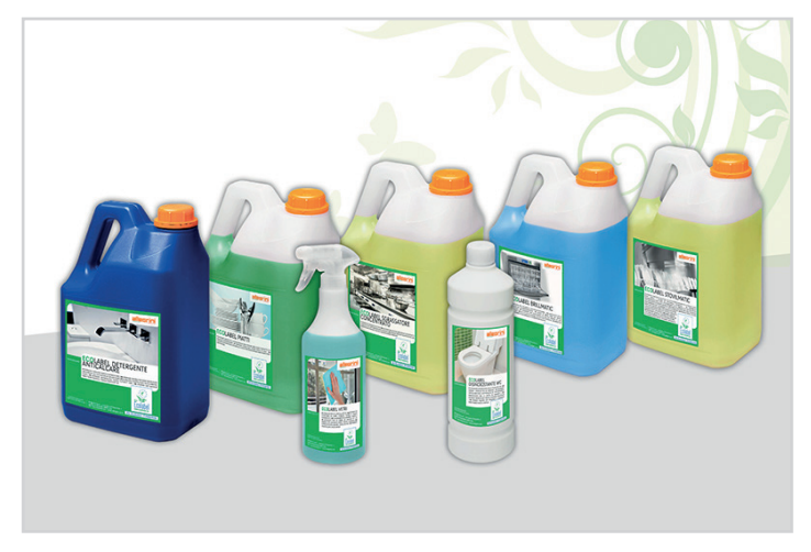
Internationally recognized certifications, with the most green label of Europe: the Ecolabel products range .