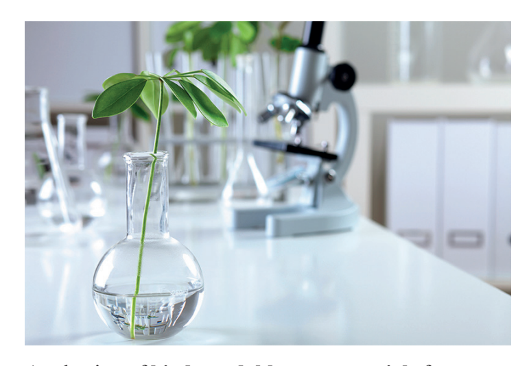
A selection of biodegradable raw materials for detergents formulations.

In Allegrini, we care about the ecosystem safety. That's why we daily pledge to offer solutions with reduced environmental impact and to invest in the latest equipment to reduce waste.